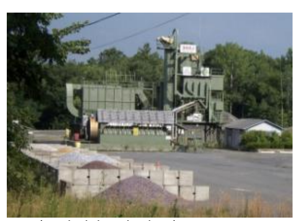
(asphalt batch plant)