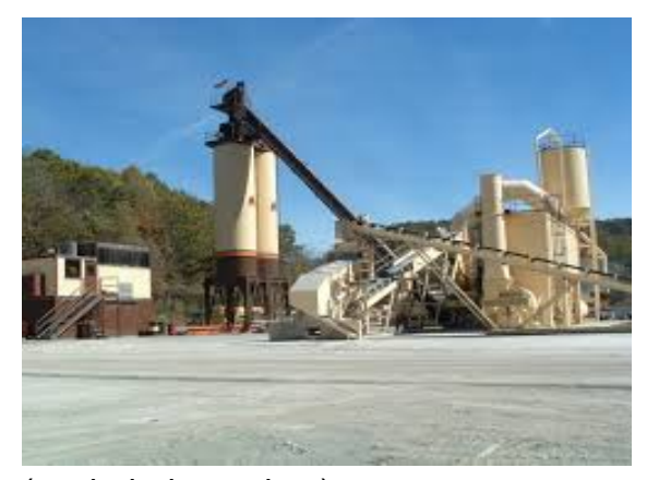
(asphalt drum plant)

Asphalt plants are a LOT harder to get permits for than concrete plants. Things like Stack Tests and other technical testing will have to be performed by independent testing labs. When planning to set up a portable Hot Mix plant for a specific project, it is imperative to confirm with local and state authorities that permits are available, and the approximate time frame it will take to issue them. Some areas have even set a moratorium on issuing any permits at all for new or temporary Asphalt plants.